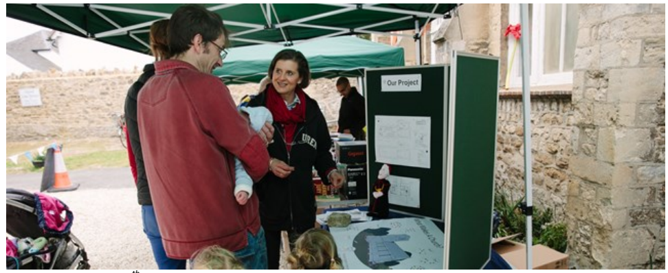
Village Hall Fete on 6<sup>th</sup> May 2017.