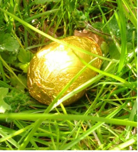
Easter Egg Hunt 2017.

In recent months we've welcomed the Scouts for Mothering Sunday, lots of families for our Easter Egg Hunt and even a real donkey , called Diana, for our Palm Sunday service. We've also had more music. One person emailed after coming on 29th April, ' The concert was fantastic and the performers stupendous. '