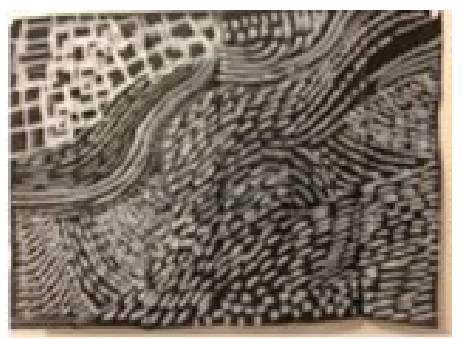
Tapestry Art work by Alex Singleton 'heart murmurs to heart as vacationing starlings depart'

Please see our churchyard where some artwork is already on display. There will be a full exhibition in church during the week running up to the event.